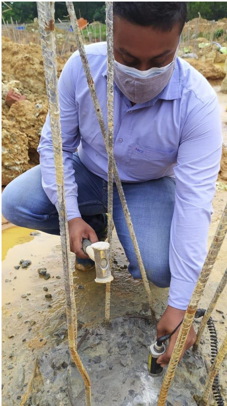
SUBHAM GROUP, AGARTALA, TRIPURA