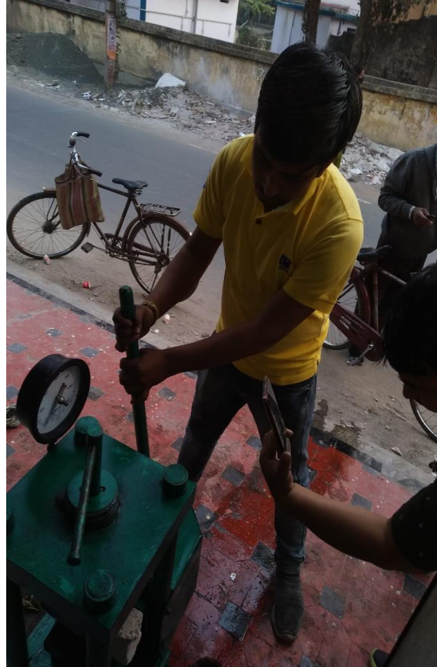
ROAD PROJECT, BARASAT, KOLKATA