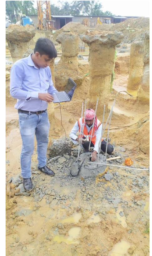
TRIPURESSARI DEVELOPERS, AGARTALA, TRIPURA