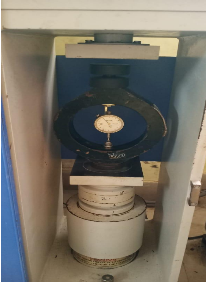
MILLENIUM CEMENT, SILIGURI, WEST BENGAL