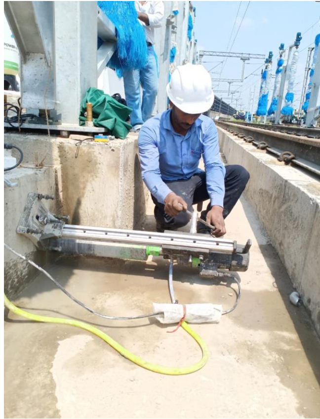
CORE CUTTING AT SCC INFRASTRUCTURE RANAGHAT, WEST BENGAL RAILWAY PROJECT

We provided Sales, Repairing Services, Calibrations, AMC of Civil Quality Control Instruments, Surveying Instruments, NDT Instruments and Consultancy Jobs like NDT of all kind of structures, Pile Integrity Testing etc. Also we provide Core Cutting Services. Online Consultancy services also provided.