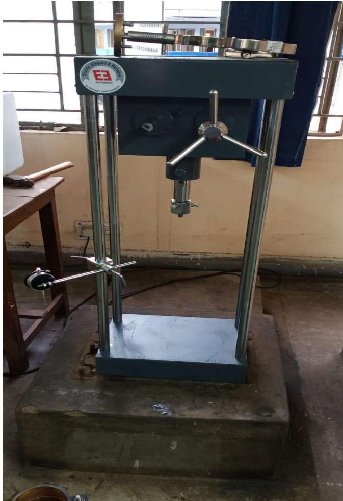
GEOLOGICAL SURVEY OF INDIA, SALLAKE, WEST BENGAL We Provide Demonstration