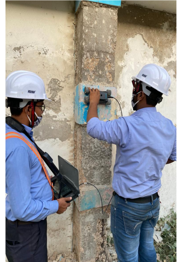
NDT AT DELHI EEPWD PROJECT

Please contact to +91 9163733432 asicoinstruments@gmail.com