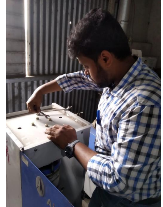
BCPL, DURGAPUR, WEST BENGAL