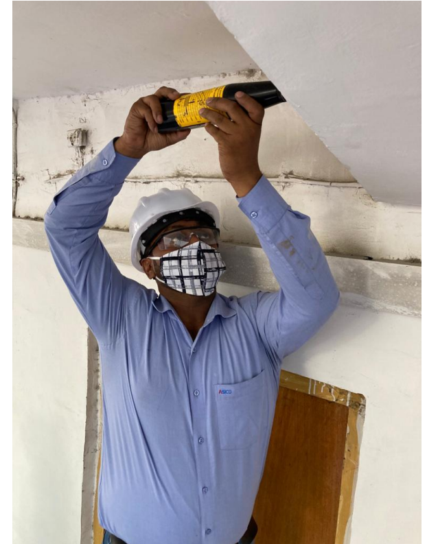
NDT AT DELHI MOULANA AZAD NEW DOCTOR'S HOSTEL PROJECT