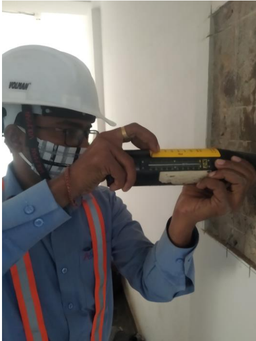
NDT AT DELHI MOULANA AZAD DOCTOR'S HOSTEL PROJECT