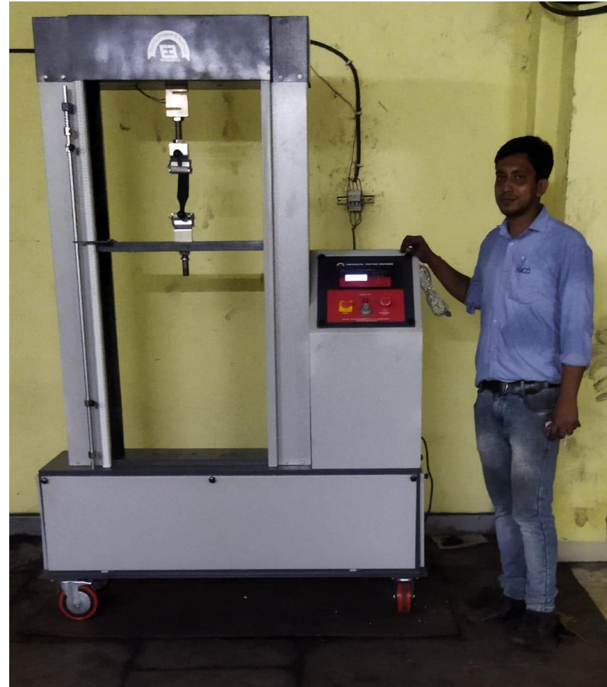
RASHMI METALIKS LIMITED, KHARAGPUR, WEST BENGAL We Supplied & Provide Demonstration